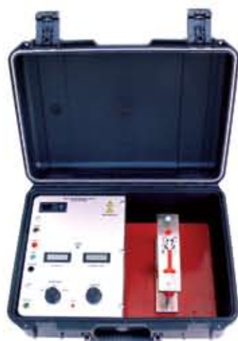
Power Semiconductor Tester Model AL3300

The Power Semiconductor Tester Model AL 3300 is specifically designed to test all types of power semiconductors rated up to 3300 volts and tests are done according to JEDEC Standards.