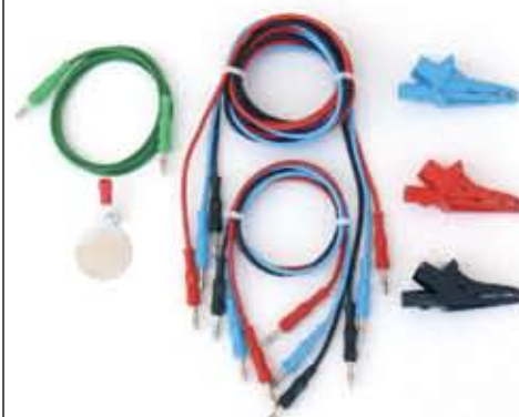
Standard Accessories for AL3300