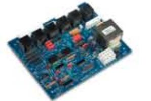
Gate Drivers for GTO's, IGBT's and SCR's