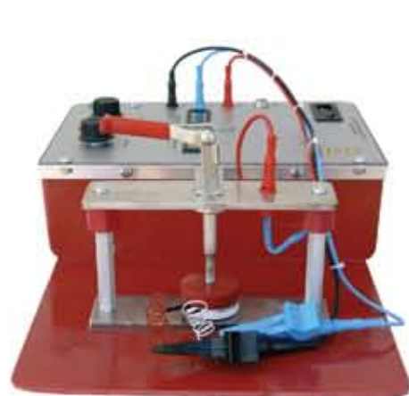
Test set-up with press pack thyristor