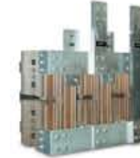
Heat Sink Assemblies