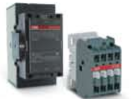
Contactors/Starters/ Circuit Breakers